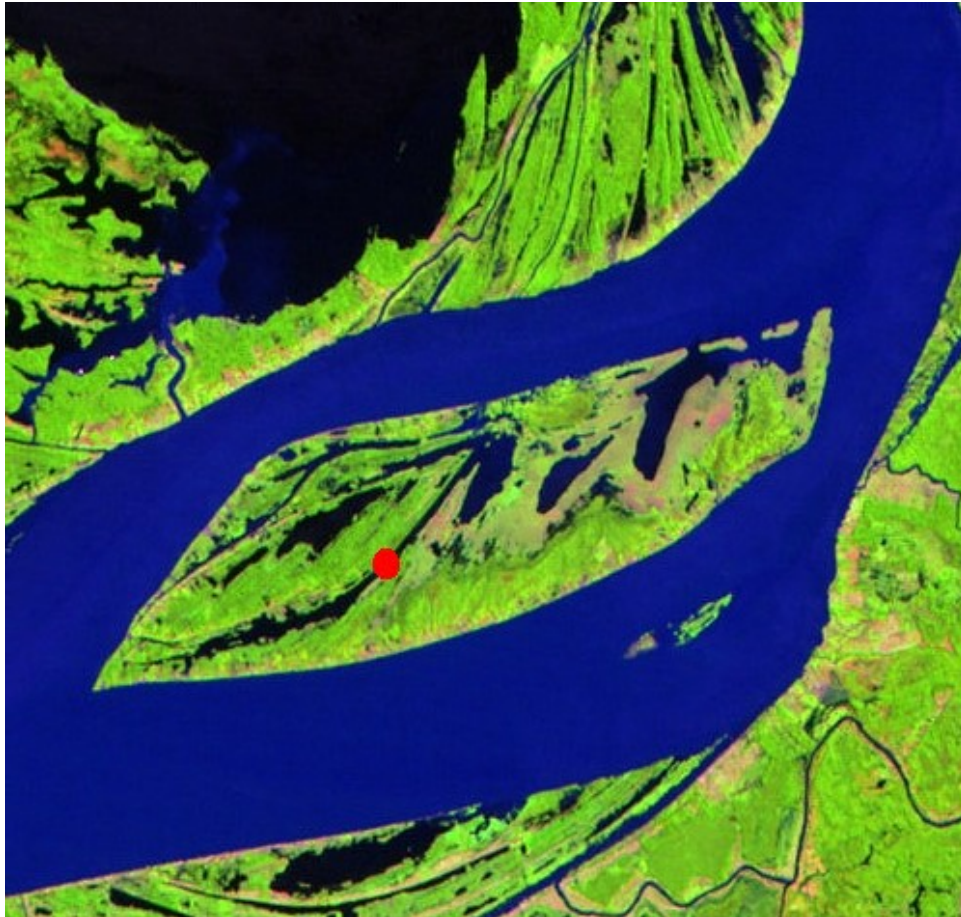
Figure 1. Island of Marchantaria and the lago Camaleão ( 3^{\circ}15'S , 59^{\circ}57'W – red mark), Amazon River. Landsat 7 ETMXS 2001080 062 L2 BANDS.

reticulata , Diaphanosoma birgei and D. spinulosum , but Moina minuta was clearly the dominant cladoceran, occurring with a frequency of 96% of all Cladocera.